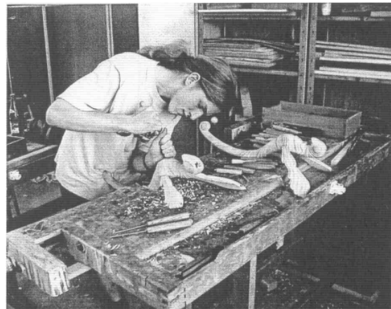
Fotografía: La Escuela media de formación profesional y el Centro de formación profesional de construcción de instrumentos musicales y muebles en Hradec Králové

suplemento de la revista Empresas y Negocios en la República Checa 01-02/2006